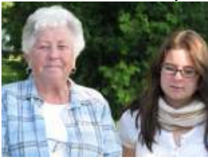
The Young and the Younger