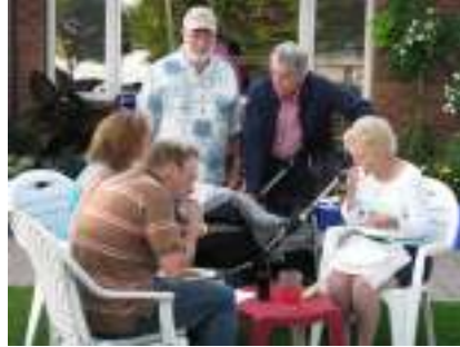
Finally, we eat!