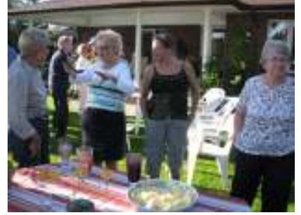
Candid photos, not!