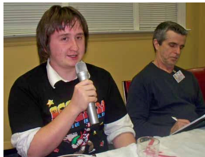
Guest Kanan went to the Rotary District Youth Exchange Orientation at the Ganaraska Forest Centre and was knocked out by all the “cool” food and the heated floors. “Met a lotta cool people.”